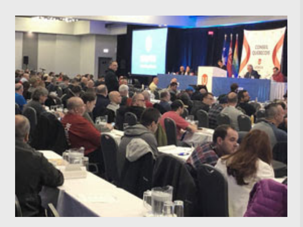
Quebec Council concludes with a commitment to solidarity and a donation