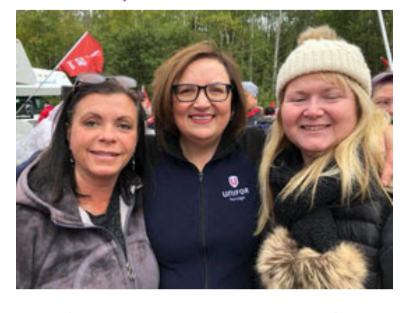
Unifor asks all parties in NL election for a