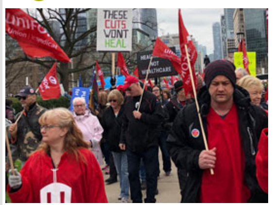
Thousands of activists stood united