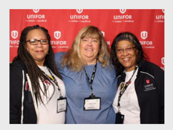
Atlantic Regional Council reviews a year of incredible solidarity and outlines the